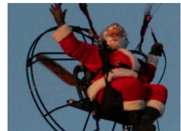
Ever take a close look at that guy flying the powered Para-Sail over our field?