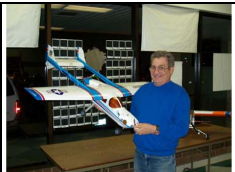
Dave Engel's Cessna 310 Skymaster by Nitro Models has two 25 size engines.